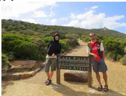
[3]Cape point Kliknij obrazek aby powiększyć