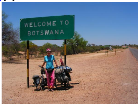
[3]Welcome to Botswana kliknij obrazek aby powiększyć